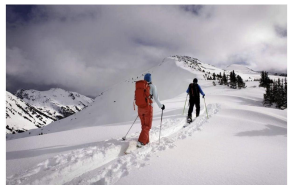
Ski hoppers along McGillicuddy Pass in British Columbia.