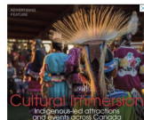
Cultural Immersion Indigenous-led attractions and events across Canada