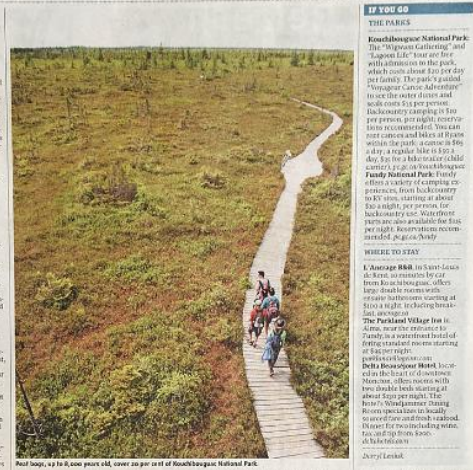
Trail dogs, up to 8,000 feet, cover one per cent of the Saguenay Fjord National Park.

A weekend road with kids can be complicated and, to be frank, the rewards of camping in the wild are seldom worth the effort. So after receiving word that the Saguenay Fjord National Park was opening up to wilderness areas, we wanted to see if we could find the perfect answer in an outdoor setting for our five-year-old son and enough outdoor light for us. With each park, we had a different experience. In Saguenay Fjord National Park, we had a different experience. In Saguenay Fjord National Park, we had a different experience.